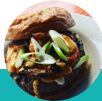
Taos Ale House